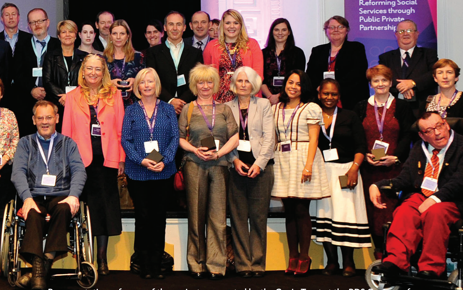
Representatives of some of the projects supported by the Genio Trust at the RDS Genio conference October 2013